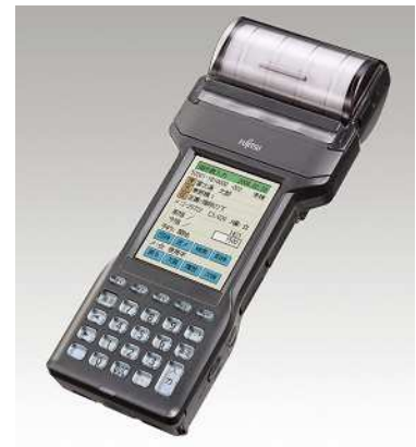
Fujitsu Frontech Handheld Terminal