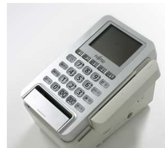
Fujitsu Frontech Payment Terminal